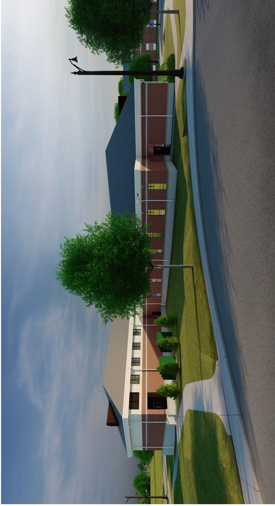
View from North looking Southeast