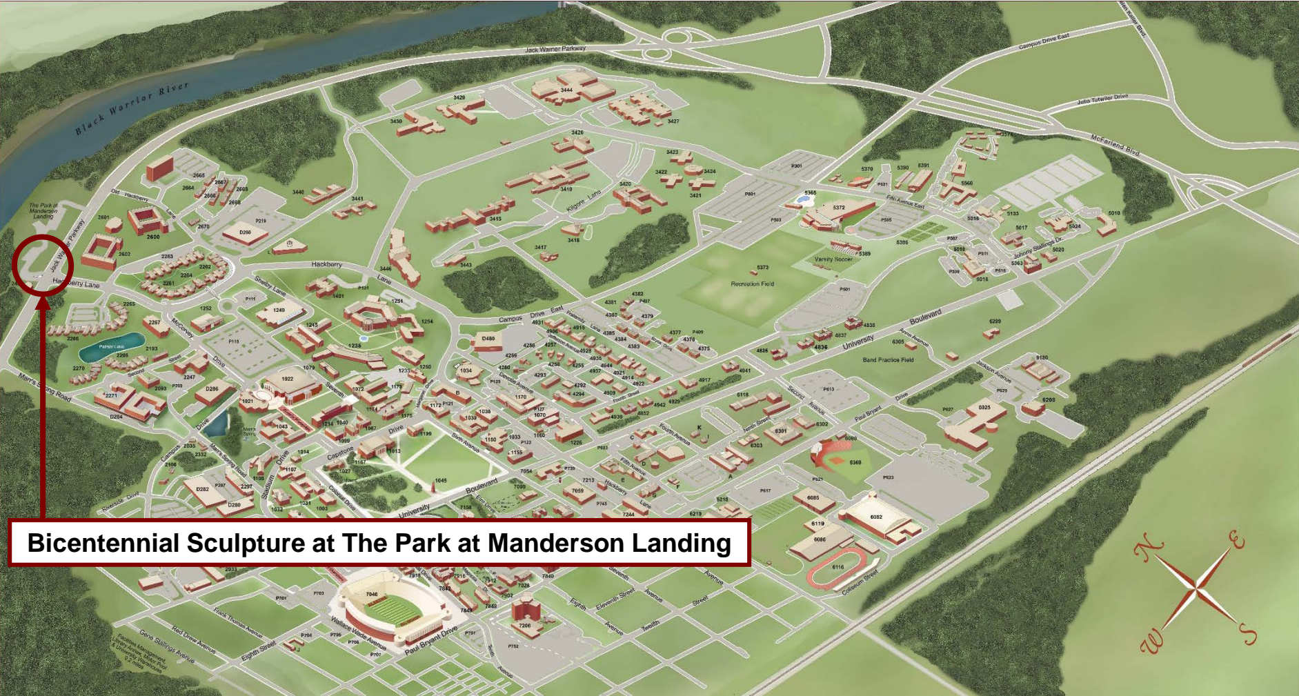
Bicentennial Sculpture at The Park at Manderson Landing